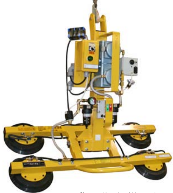
Shown with optional Vacuum Loss Warning Buzzer, Green Lift Light and Individual Pad Shutoffs.

Featuring 90° tilt and a high-flow vacuum system, this Powr-Grip® vacuum lifter is designed specifically for lifting, tilting and transferring stone and other high-density materials.